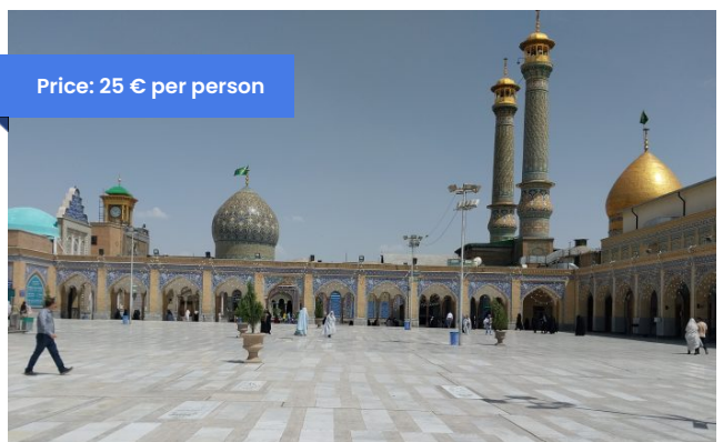
Emam Zadeh Saleh Holy Shrine Tour, 3-4 Hours, 20-35€ Per person