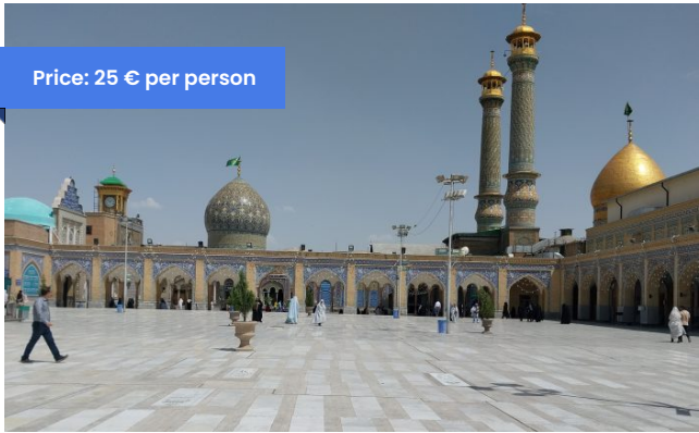
Shah-Abdul-Azim holy shrine Tour, 3-4 Hours, 25€(By Metro+ Snap)per person & 40€(by Private Car) per person