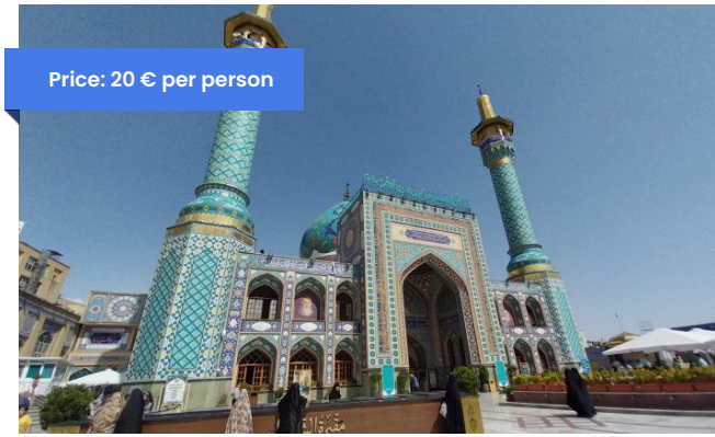
Emam Zadeh Saleh Holy Shrine Tour,3-4 Hours, 20-35€ Per person