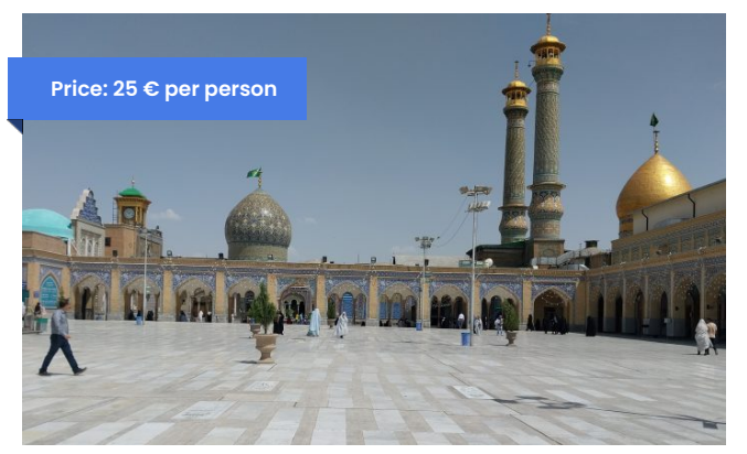
Shah–Abdul–Azim holy shrine Tour, 3–4 Hours, 25 \epsilon (By Metro+ Snap)per person & 40 \epsilon (by Private Car) per person