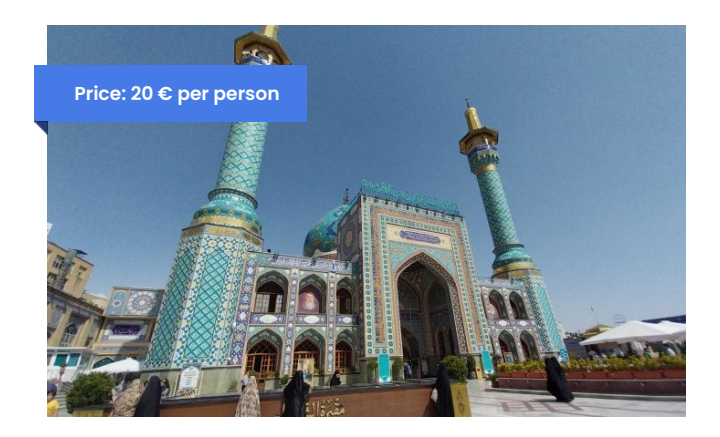
Emam Zadeh Saleh Holy Shrine Tour,3–4 Hours, 20-35\mathfrak{E} Per person