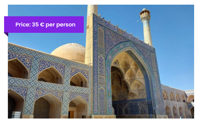
Isfahan UNESCO sites Tour, 35 \epsilon per person