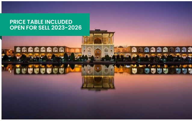
Iran Top Culture Tour–Iran Top Golden Route Tour: Shiraz 3N, Yazd 1N, Isfahan 2 N, Tehran 1N(7Nights/8Days)