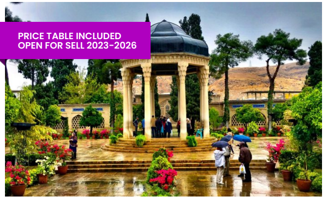
Iran Top Culture Tour/Iran Top Economy Tour: Shiraz Top Tour: 4 Nights/5 Days Shiraz