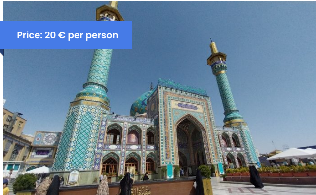
Emam Zadeh Saleh Holy Shrine Tour, 3-4 Hours, 20-35€ Per person