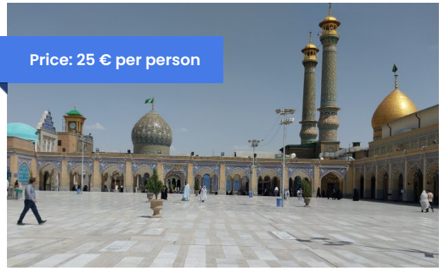
Emam Zadeh Saleh Holy Shrine Tour, 3-4 Hours, 20-35€ Per person